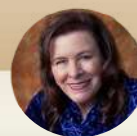
Co-Founder, Human Potential Movement; Chancellor Meridian University