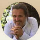
Co-Founder Home for Humanity Prof. Da Vinci Institute