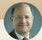
Former UN Under Secretary- General; Former Head of UN Peace Operations