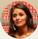
Co-Founder Home for Humanity; Founder Oxford Enacting Global Transformation